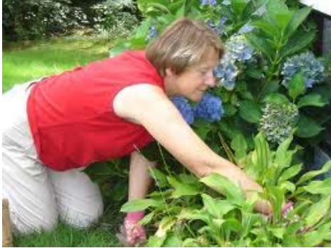
Left: An Unknown but Committed Weeder.