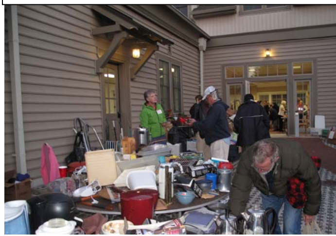
Below Left & Right: Shoppers Finding Bargains Inside and Out.