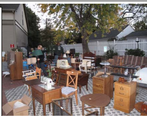
Left: Our Dedicated Volunteers Awaiting the Sale's Beginning Friday morning.