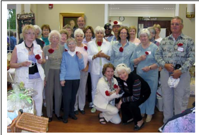
Volunteers and their red roses ready to begin the sale Friday

The week of May 9, during our Spring Rummage Sale, a large group of dedicated, creative volunteers transformed your donations into $7,350! This money will be donated to ECW charities, where it will assist those in need. Our leftovers were shared with two charitable organizations, which will make sure they are distributed to the neediest in our community. Members of Trinity Cathedral's rummage sale team will take some items for their sale in June, and our unsold books have been given to St. Michaels Library.