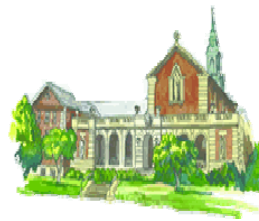
Jesuit Center at Wernersville, PA

Though I absolutely loved going to Wernersville, I didn’t like being in the oratory. I remember putting my face against the grille and trying to look sideways to see what was going on in the sanctuary. This did not sit well with my mother who expected saintly behavior in church. It was a relief when Mass was over and I was free to roll down the grassy lawn, run through the boxwood gardens or bang on the piano in the parlor.