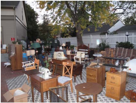
Scenes from the Fall 2010 Rummage Sale:

Only 3 More Weeks to fill all those boxes and bags that you've allocated for your gently used spring and summer donations to the Spring Rummage Sale. So start going through your drawers, closets, attics, garages, linens and jewelry boxes to collect those items that you no longer need or want. If appropriate, ask your children at home to do the same. We all have some extra things that someone else could use. Drop off your castaways at the Parish House on May 9, 10 and 11 from 9:00 AM to 3:00 PM. Sale days are Friday, May 13 from 7:00 AM to 2:00 PM and Saturday, May 14 from 8:00 AM to noon. All proceeds go directly to charities. If you have questions, please contact Judy Sandgrond 410-745-5118. Call Lillian Watts at 410-745-9999 if you have jewelry donations. She'll be happy to pick them up!