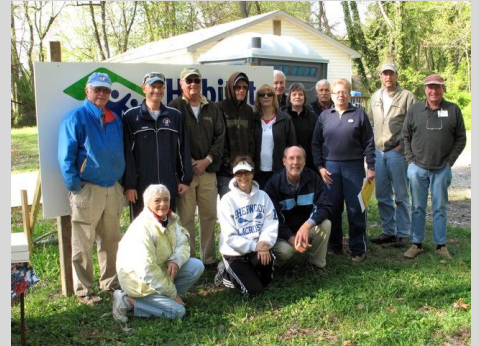
Some of our parish volunteers at the groundbreaking of the St. Michaels Faith Build on April 10, 2010.

In April 2010, Christ Church initiated a partnership with St. Luke's United Methodist Church, Union United Methodist Church and St. Michael's Roman Catholic Chapel, under the auspices of Habitat for Humanity Choptank, and broke ground on a new Habitat house in St. Michaels. Over the past year we have provided labor and food at the worksite and have raised over $75,000 to build the house. Our work continues and additional volunteers are always welcome.