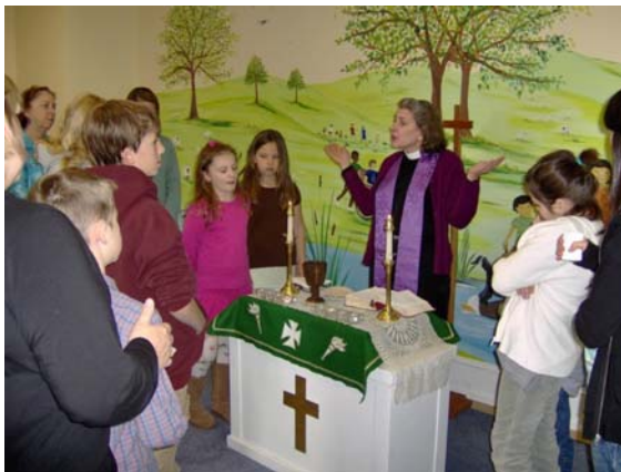
Left: Celebrating Holy Communion in the Children's Chapel