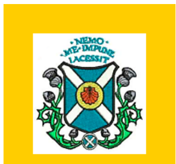
St. Andrew's Society of the Eastern Shore