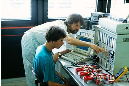
A vocational electronics student