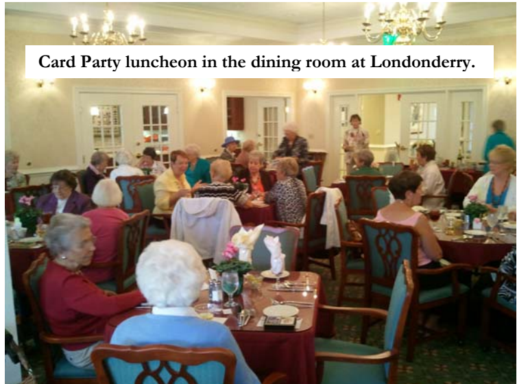
Card Party luncheon in the dining room at Londonderry.