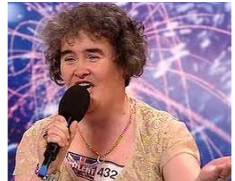
Does Christ Church have a Susan Boyle?

We are in the initial planning stages of this all-parish event and are looking for acts of all kinds. Please let us know if you would like to be in the show ASAP. And, if after much thought, you truly feel you are unable to come up with a talent for the show, perhaps you can be a talent scout and let us know about the gifts of your fellow parishioners.